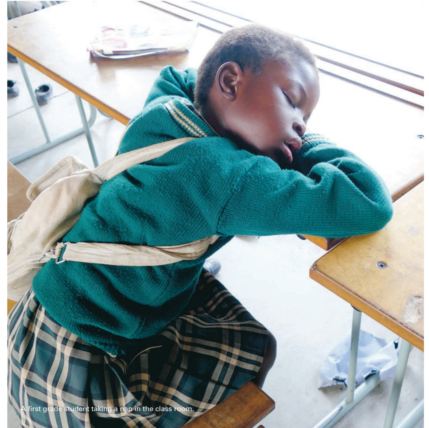
A first grade student taking a nap in the class room.