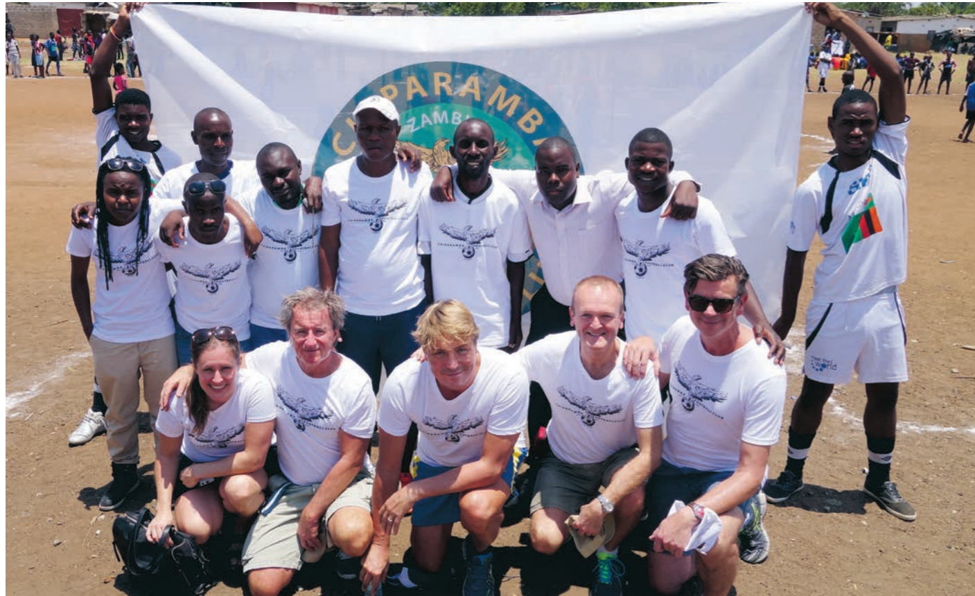
The first day of our visit the board visited Kampala ground in Garden, Lusaka, for watching a football tournament with 200 youths (both boys and girls) participating. The event was successfully arranged by the staff and coaches from Chiparamba Breakthrough Sports Academy.