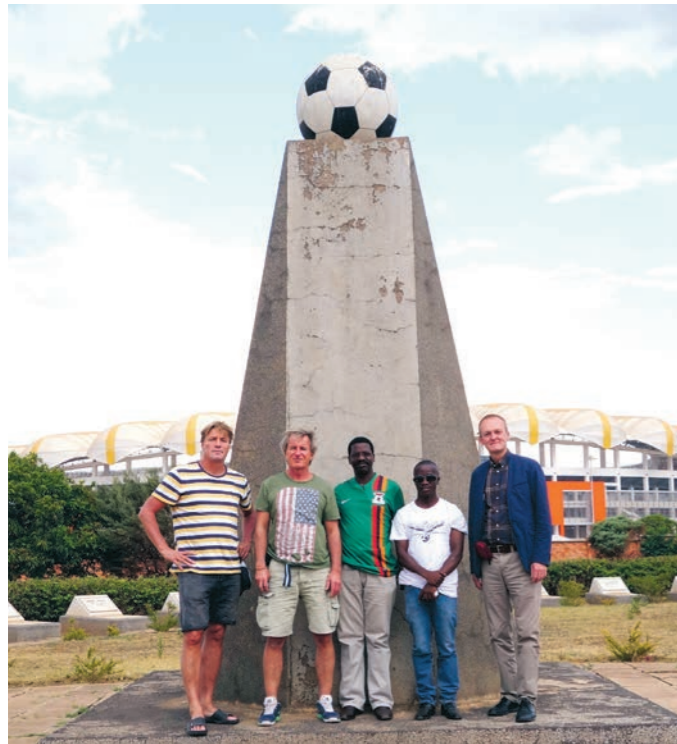
Visit at the memorial place "Heroes Acre", outside the Independence Stadium. The 1993 Zambia national football team air disaster occurred in the late evening of 27 April 1993 when a Zambian Air Force plane crashed into the Atlantic Ocean about 500 metres offshore from Libreville, Gabon. The flight was carrying most of the Zambian national football team to a FIFA World Cup Qualifier against Senegal in Dakar.