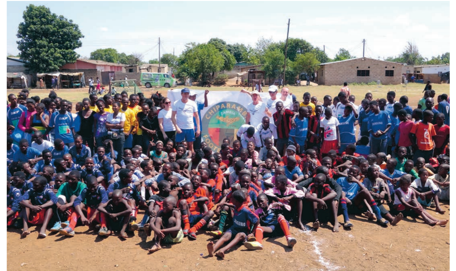
The board of Chiparamba FC wishes all the players good luck in today's football tournament.