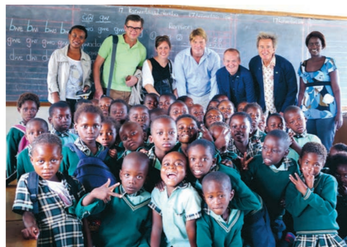
Chiparamba FC board members visiting Northmead Primary School in Lusaka, where a few of the Chiparamba FC players are studying.